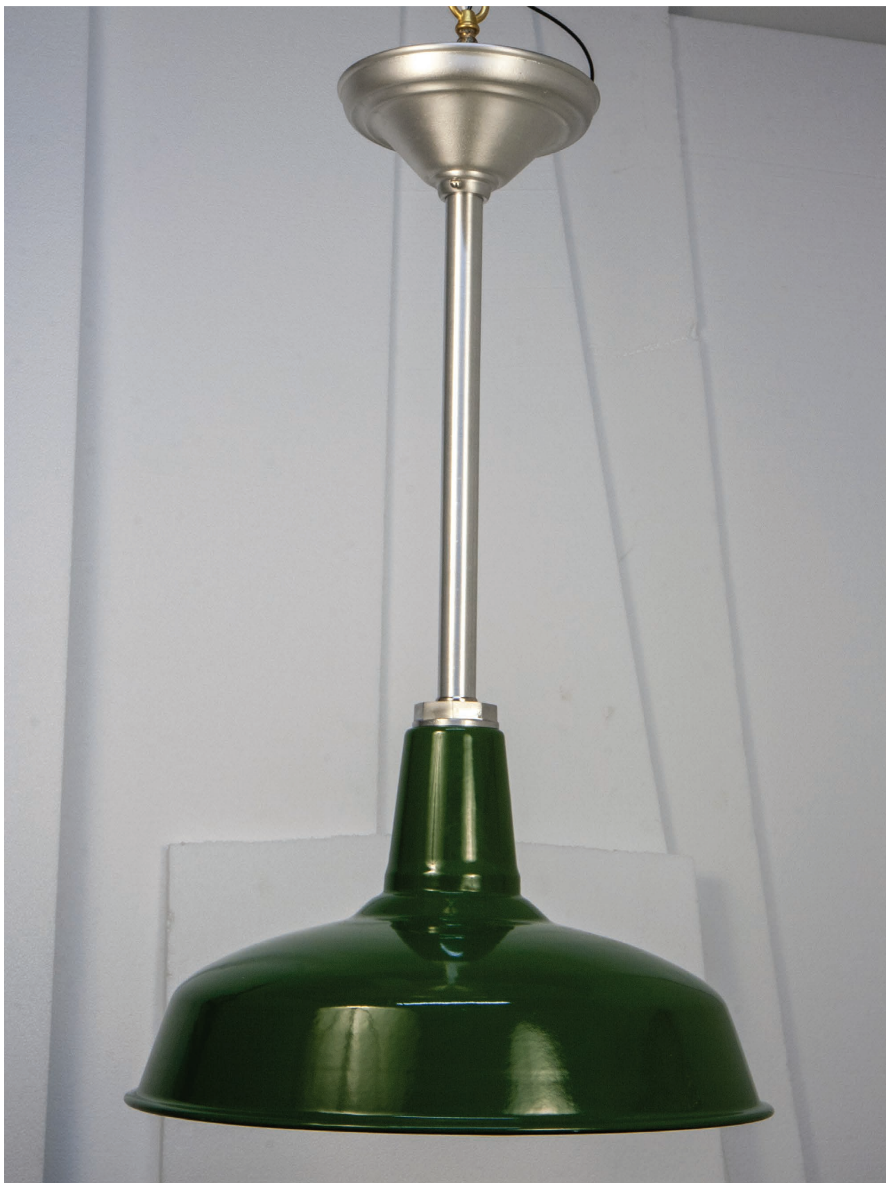
UA0366-17 SV 9 1/2"h x 14"Ø Quantity: 6 $1,400