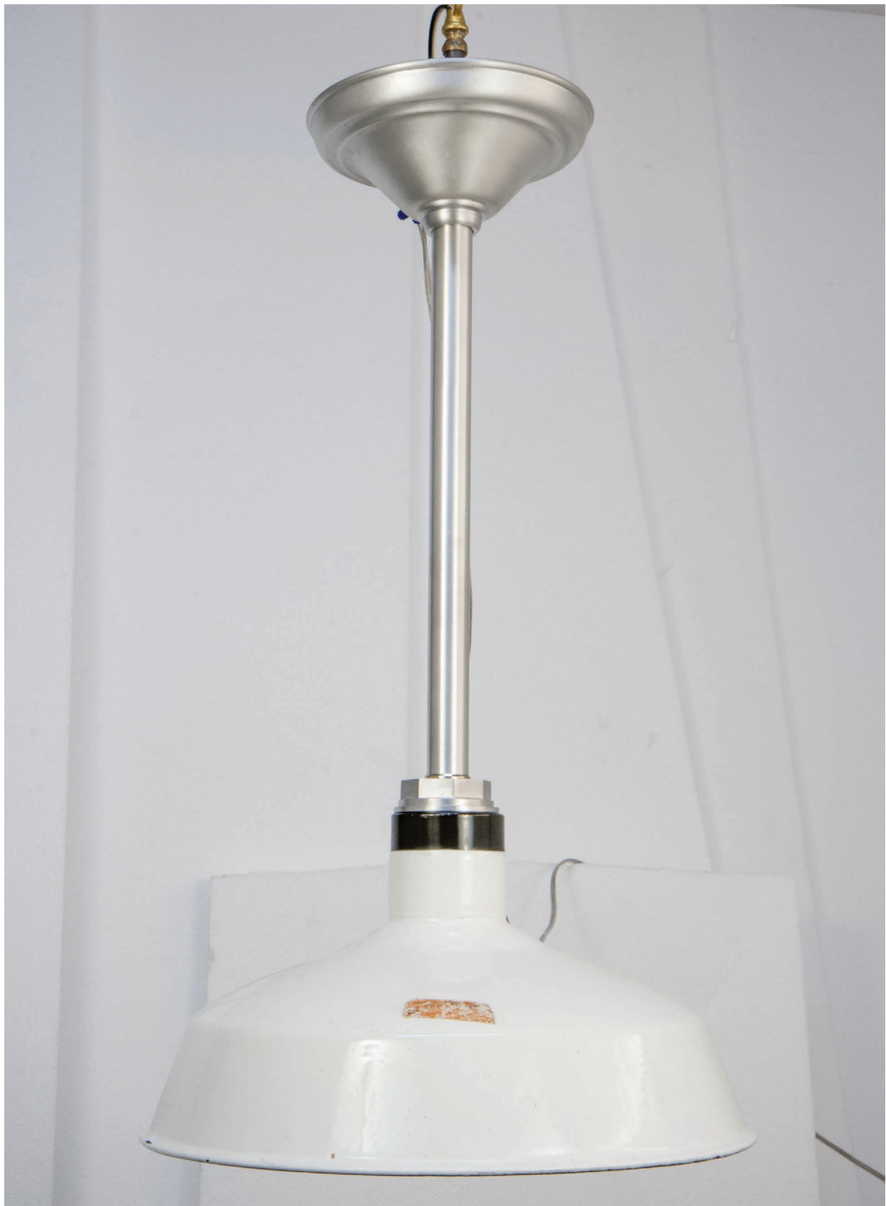
UA0366-13 SV 7"h × 14"Ø Quantity: 3 $1,400