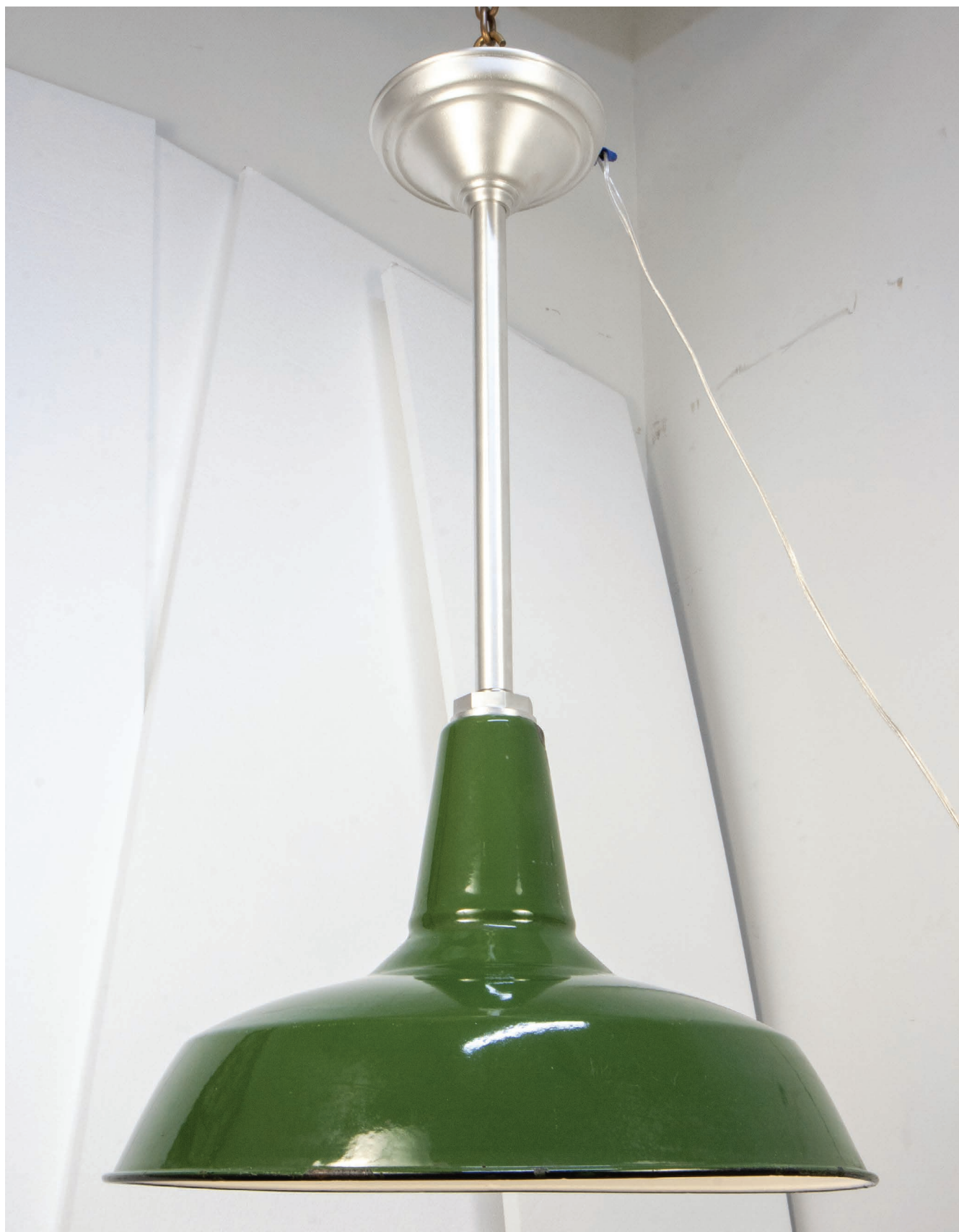
UA0366-10 SV 10 1/2"h × 16"Ø Quantity: 12 $1,400