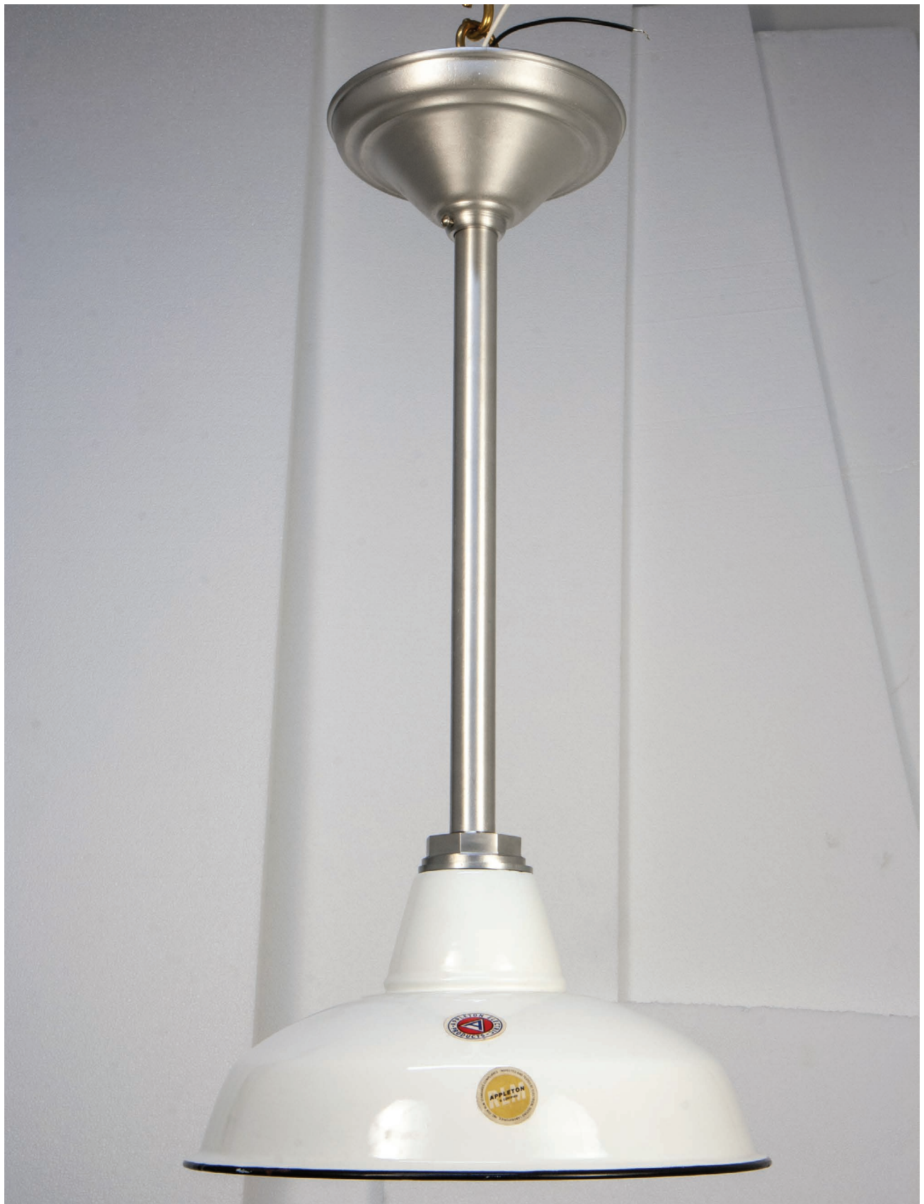
UA0366-14 SV 6"h × 12"Ø Quantity: 24 $1,200