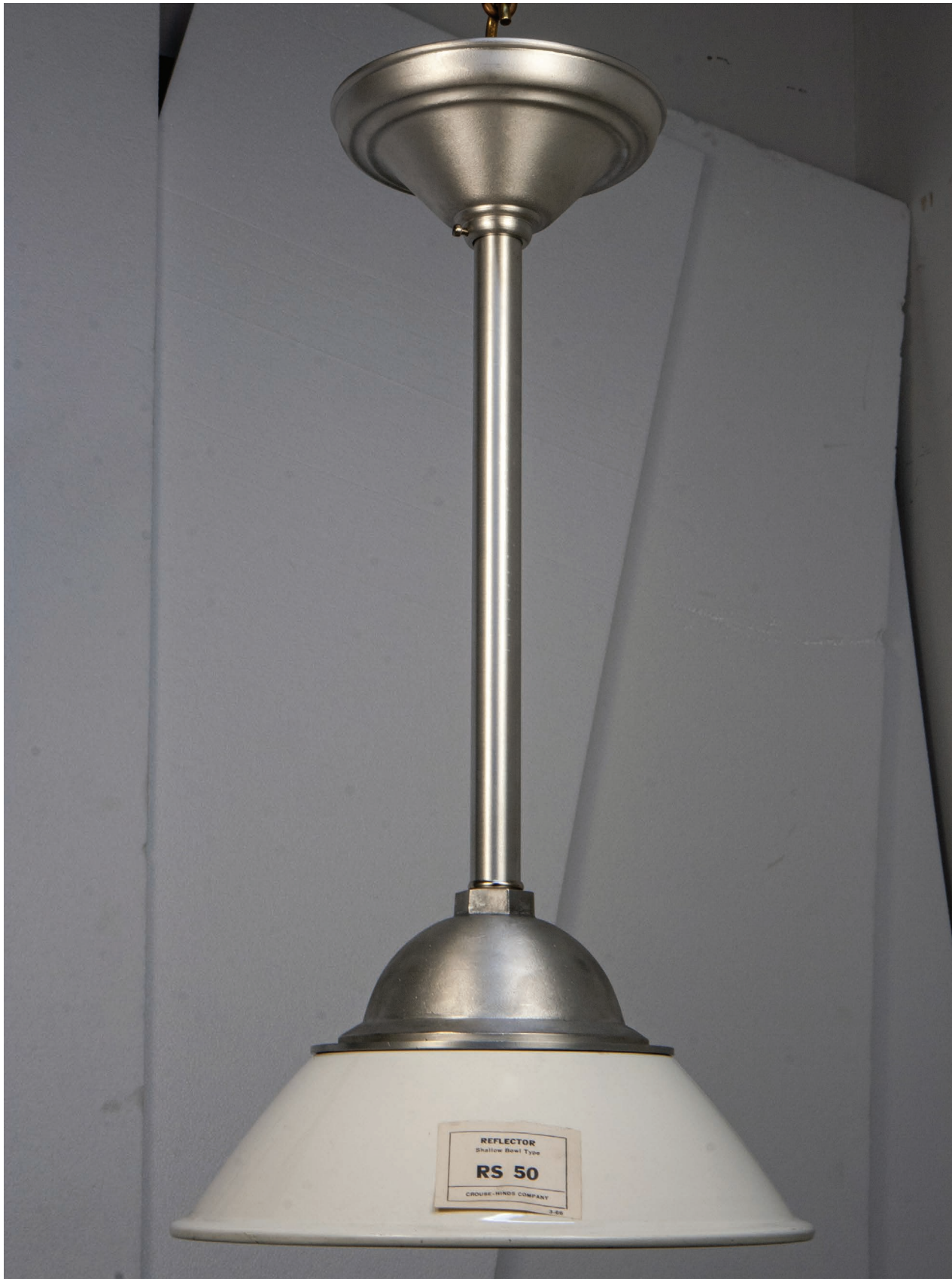
UA0366-25 SV 7"h x 12"Ø Quantity: 3 $1,200