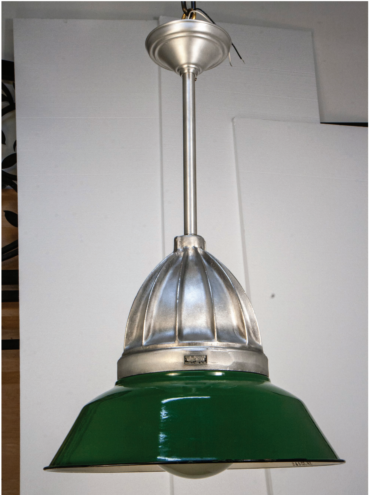
UA0366-31 SV 18"h x 20"Ø Quantity: 10 $4,500