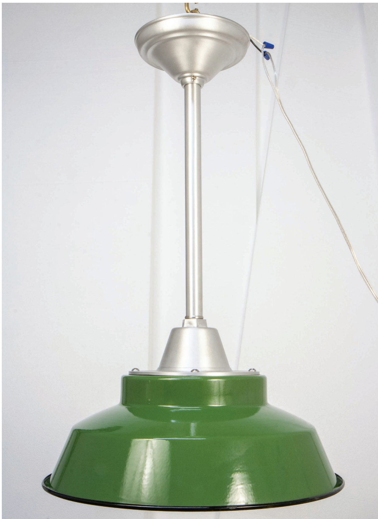
UA0366-9 SV 9"h × 16 5/8"Ø Quantity: 9 $1,400