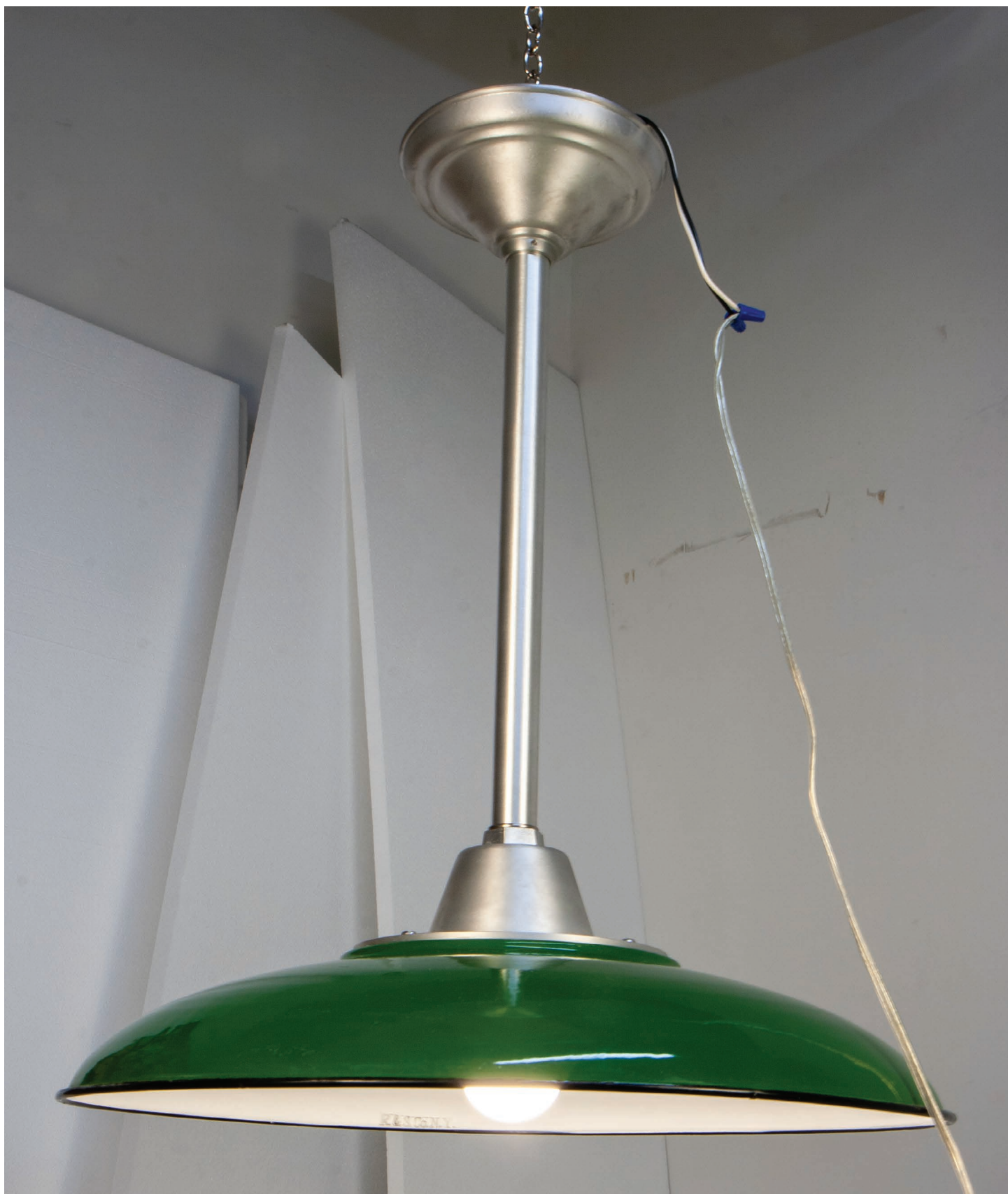
UA0366-1 SV 6 1/2"h x 16"Ø Quantity: 21 $1,400