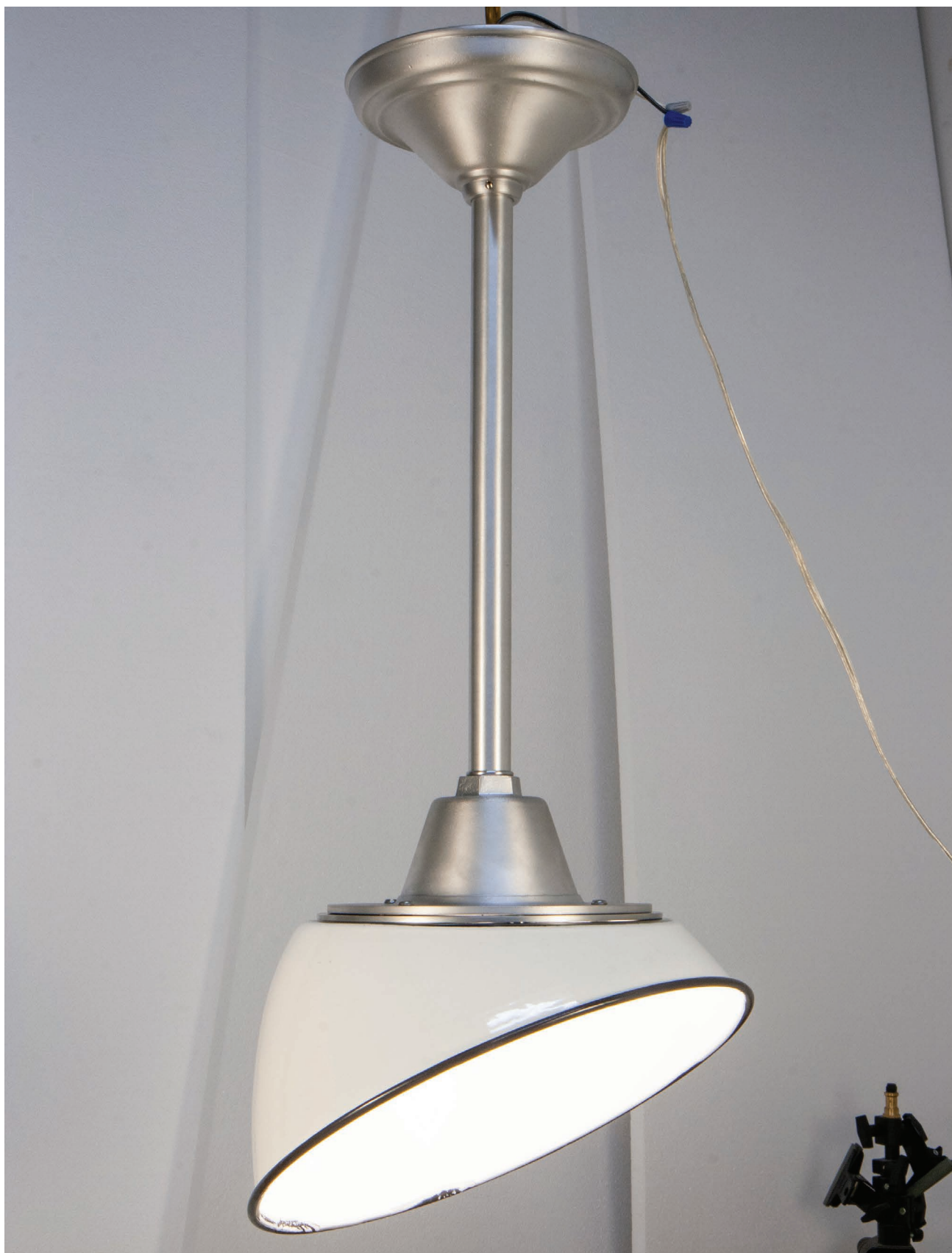
UA0366-6 SV 11 1/2"h x 12"Ø Quantity: 12 $1,200