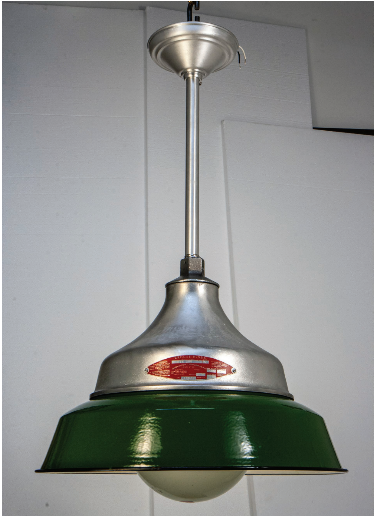
UA0366-37 SV 14"h x 20"Ø Quantity: 10 $4,500