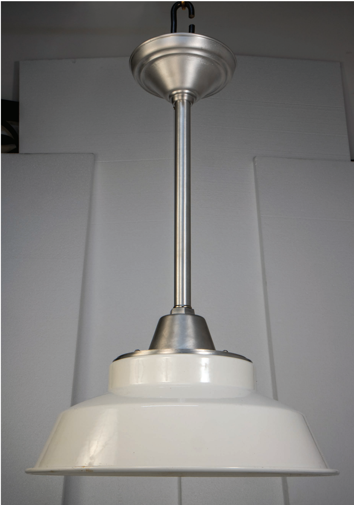
UA0366-39 SV 9"h × 16 7/8"Ø Quantity: 7 $1,600