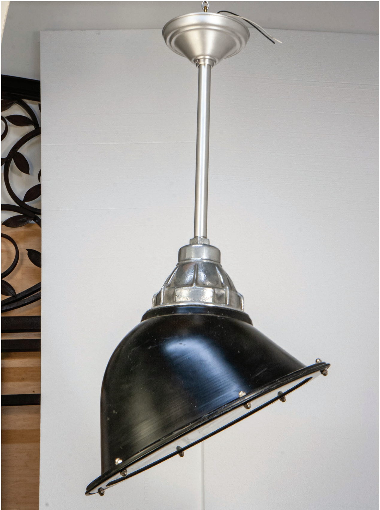
UA0366-33 SV 15"h x 19 1/2"Ø Quantity: 1 $2,000