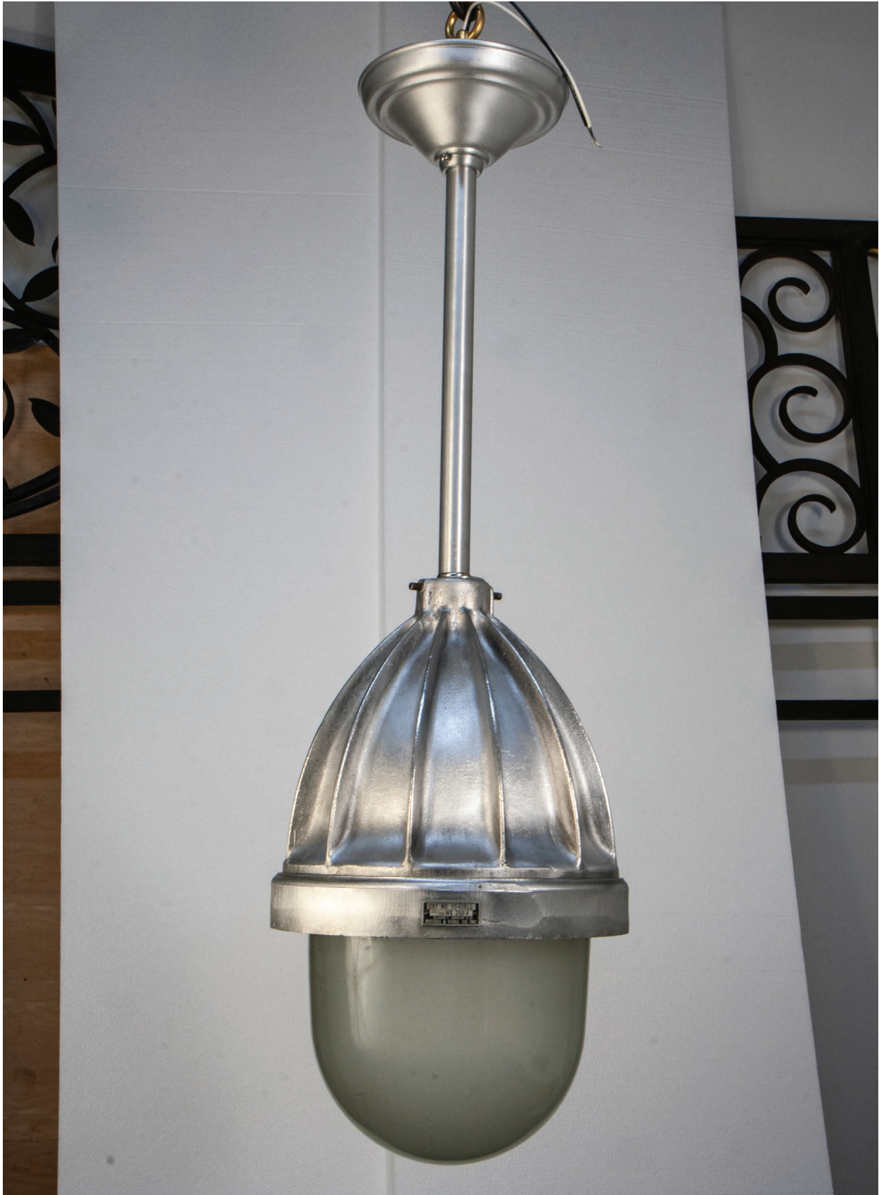
UA0366-34 SV 11"h x 12"Ø Quantity: 30 $3,500