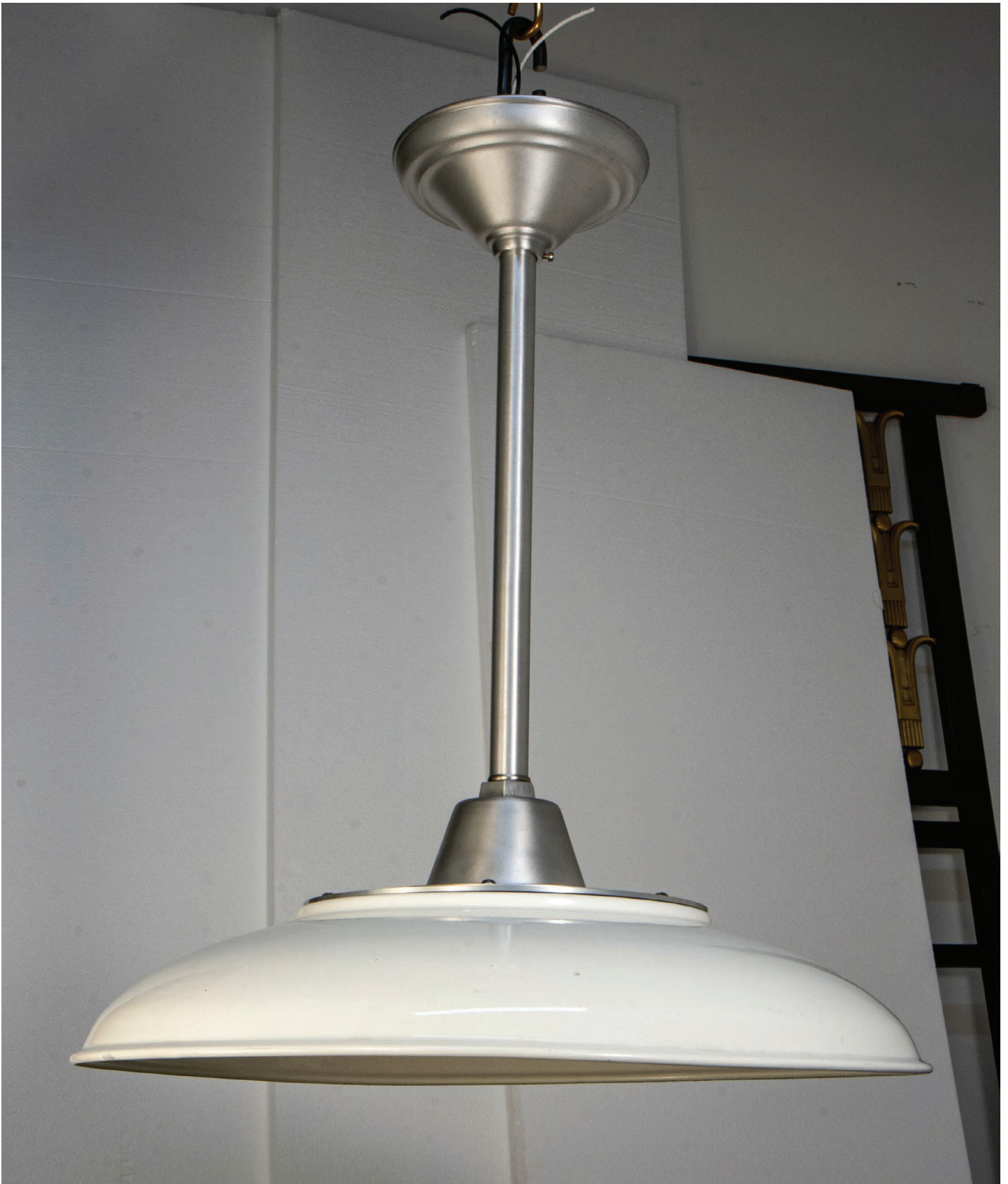
UA0366-35 SV 8"h × 21"Ø Quantity: 7 $1,600