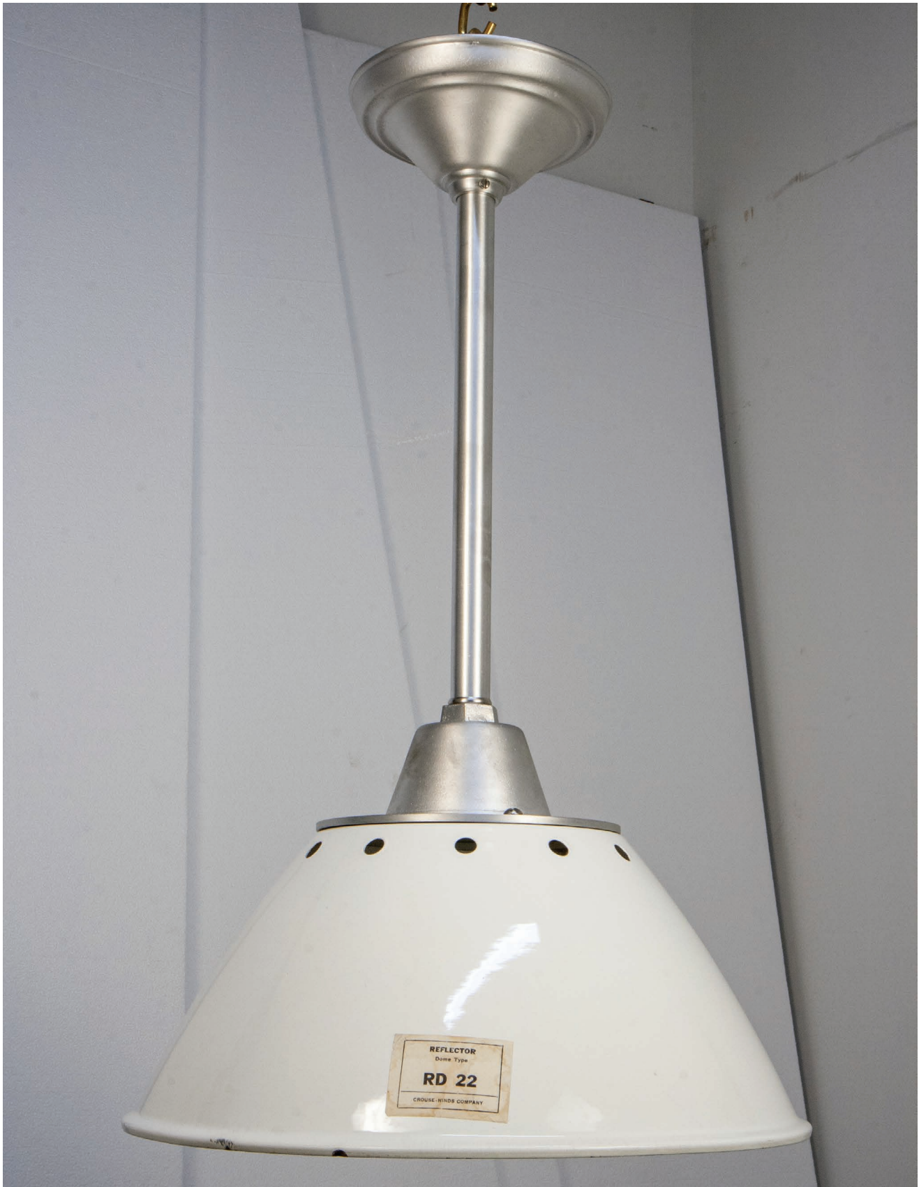
UA0366-20 SV 8"h x 16"Ø Quantity: 5 $1,400