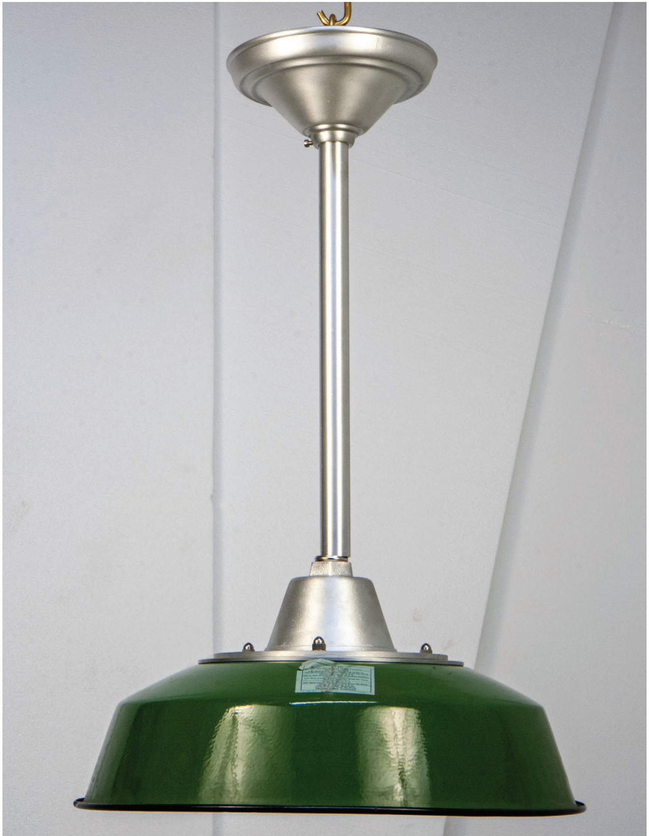
UA0366-23 SV 8 1/4"h x 16"Ø Quantity: 7 $1,400