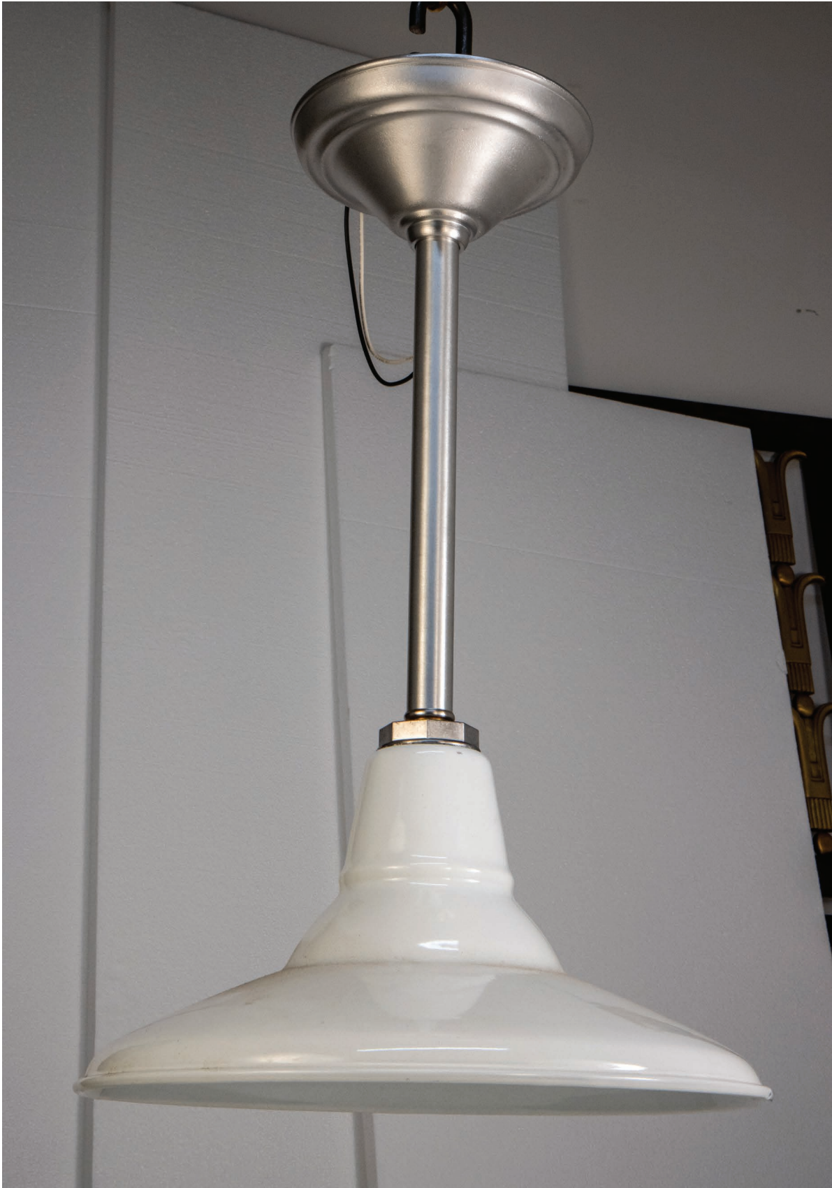
UA0366-38 SV 8"h × 14"Ø Quantity: 50 $1,400