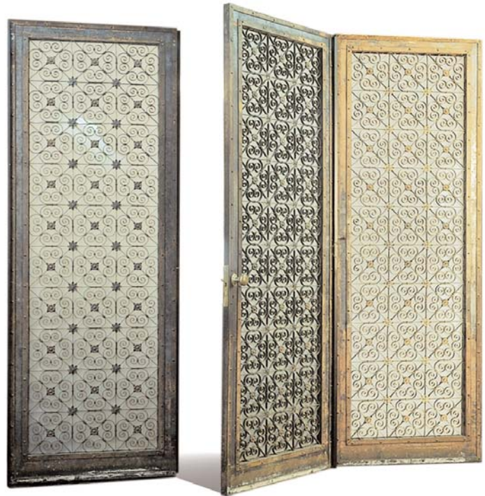
*doors are shown restored, and do not reflect the pricing shown below.

The iron panels are part of a lot in varying condition. Additional panels are available. Pricing shown below is per-panel and pre-restoration.