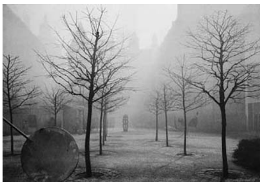
A view of the garden taken by Ansel Adams