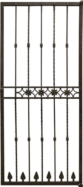
Style 3 4 available