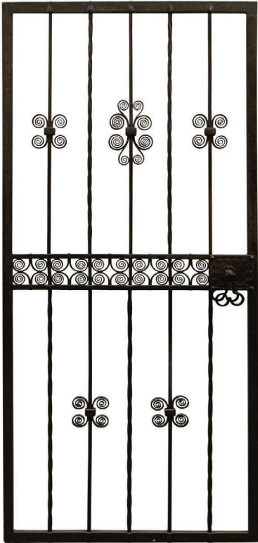
Style 1 6 available