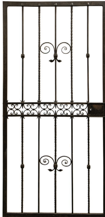
Style 2 2 available