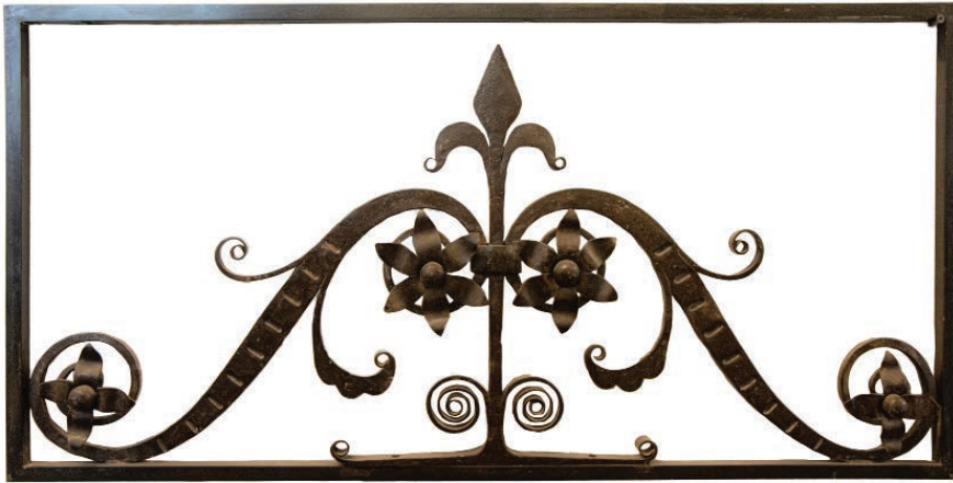
Style 1 1 Small available 2 Large available