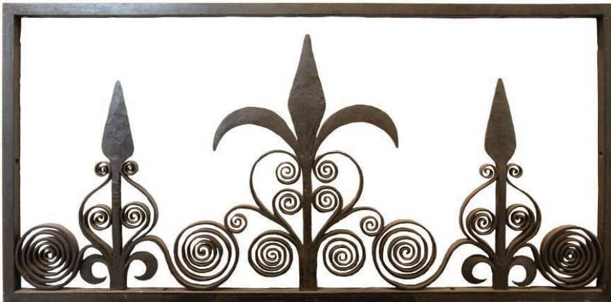
Style 3 2 available