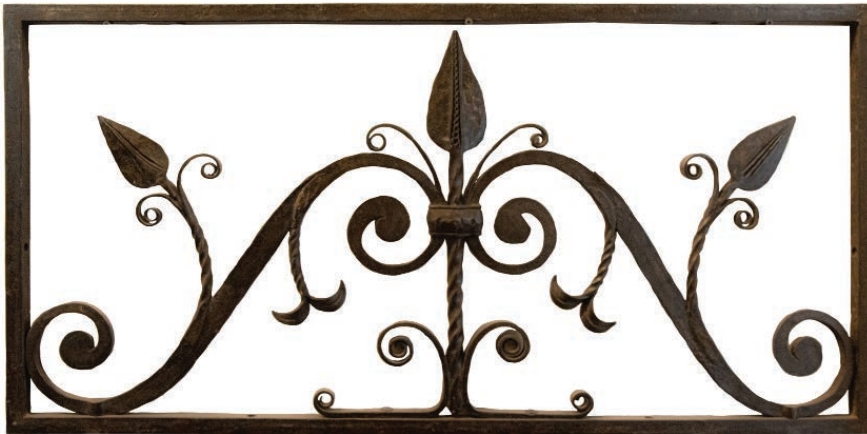
Style 2 1 available