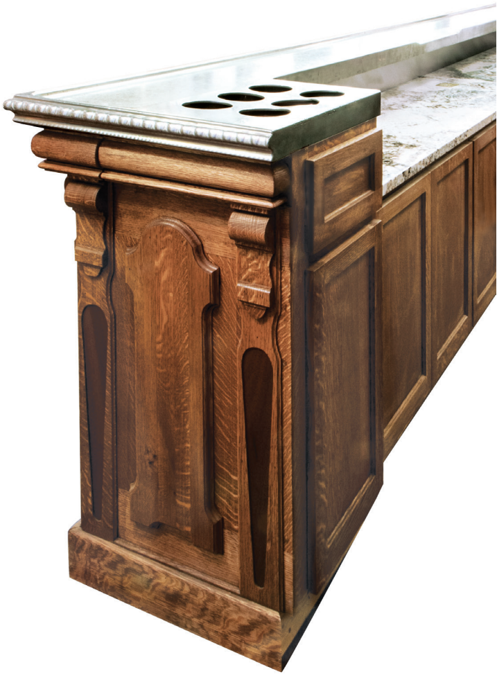
Detail images of the side and back of the Pewter Top Bar.